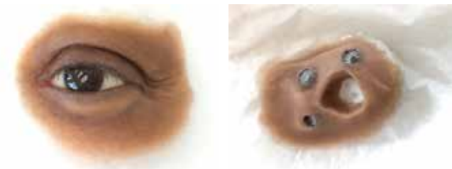
Left orbital prosthesis that attaches with magnets to bone-anchored implants.

Most reconstructive prostheses are covered by Medicare and health insurance plans. We are patient advocates and, with your permission, we will prior authorize the prosthesis and submit a claim on your behalf once the prosthesis is complete.