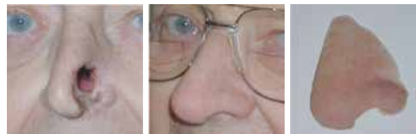
Partial nasal prosthesis that attaches with medical-grade skin adhesive.

Most reconstructive prostheses are covered by Medicare and health insurance plans. We are patient advocates and, with your permission, we will prior authorize the prosthesis and submit a claim on your behalf once the prosthesis is complete.